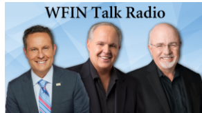
Brian Kilmeade • Rush Limbaugh Dave Ramsey